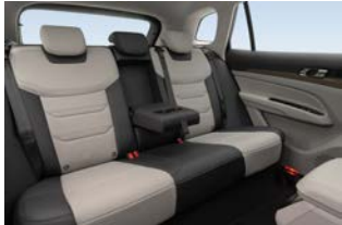
TITANIUM X Urban Grey & Domino