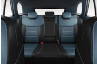
TITANIUM Peacock Blue & Domino

Express Service, Extended Warranty, and Scheduled Service Plan are applicable to select Ford vehicles. Pickup & Delivery is available in select dealers. Terms and conditions apply.