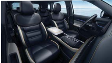
SPORT Domino and Chalk with Cyber Orange Accent