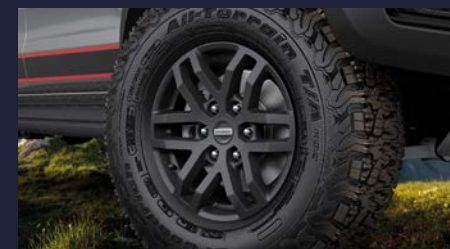
MATTE BLACK 17" ALLOY WHEELS