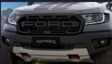
MATTE BLACK GRILLE AND BUMPER