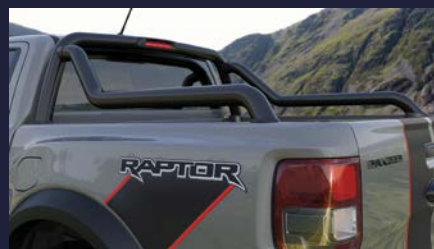
EXTENDED LEG SPORTS BAR