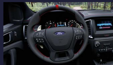
RED STITCHING INTERIOR ACCENTS