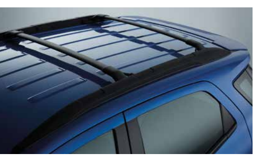
Cross Bars in Black Finish Enhances the sporty appearance of the vehicle. These bars are used as a base for all attachments such as roof racks and bike carriers.