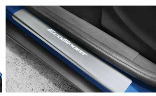
Scuff Plates — Features the Ecosport Logo. Driver and Passenger Scuff Plates help protect doorsteps from scratches and scuffs.