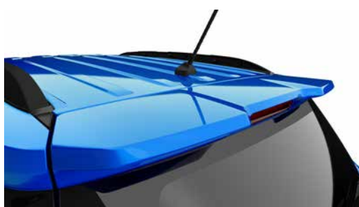
Enhances the contours of the vehicle. Gives the vehicle a sportier look. Supplied primed (paint to suit).