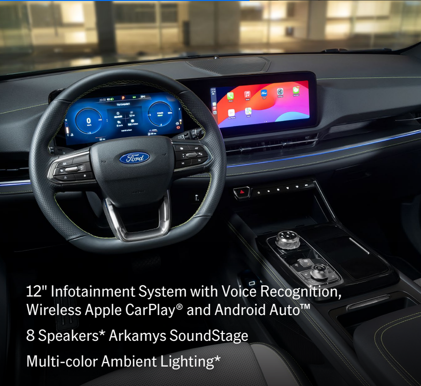
12" Infotainment System with Voice Recognition, Wireless Apple CarPlay® and Android Auto™