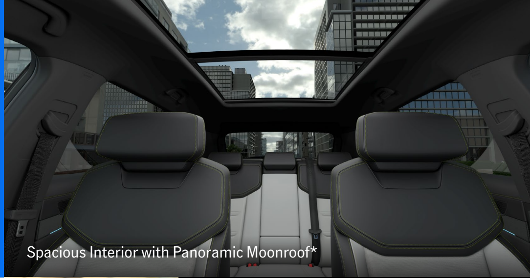
Spacious Interior with Panoramic Moonroof*