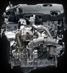
2.0L Bi-Turbo and Turbo Diesel Engine