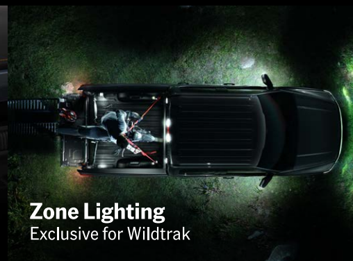
Zone Lighting Exclusive for Wildtrak