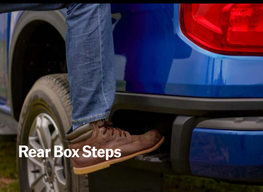
Rear Box Steps