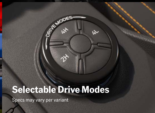
Selectable Drive Modes