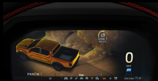
Selectable Drive Modes