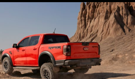
Front & Rear Locking Differentials*