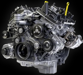
3.0L V6 Twin Turbo EcoBoost Engine*

WHERE CAPABILITY MEETS THRILL ON EVERY ADVENTURE