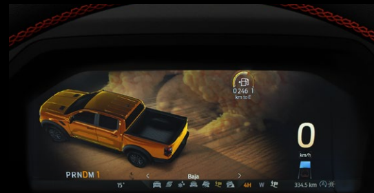
Selectable Drive Modes