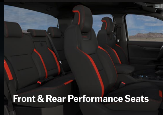
Front & Rear Performance Seats