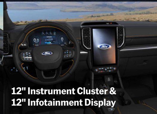
12" Instrument Cluster & 12" Infotainment Display