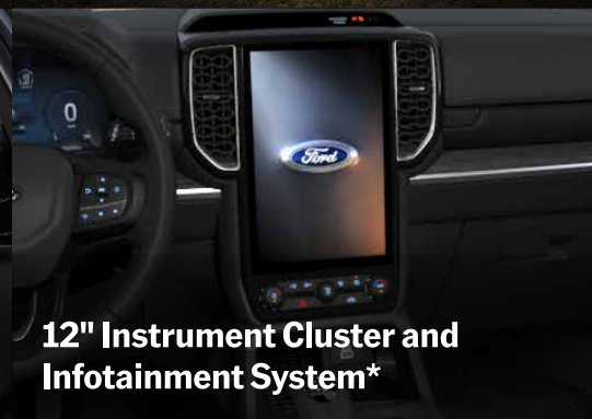
12" Instrument Cluster and Infotainment System*