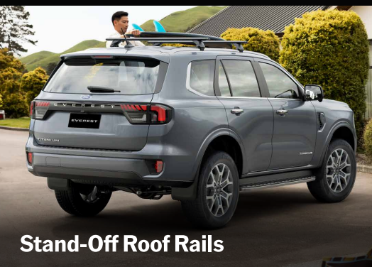
Stand-Off Roof Rails