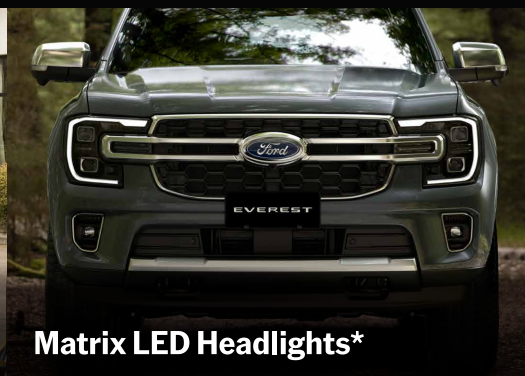
Matrix LED Headlights*