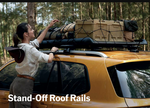
Stand-Off Roof Rails