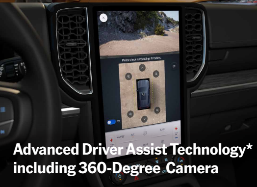
Advanced Driver Assist Technology* including 360-Degree Camera