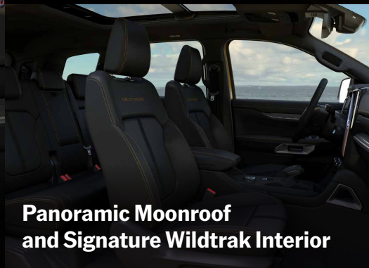
Panoramic Moonroof and Signature Wildtrak Interior