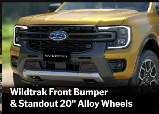
Wildtrak Front Bumper & Standout 20" Alloy Wheels